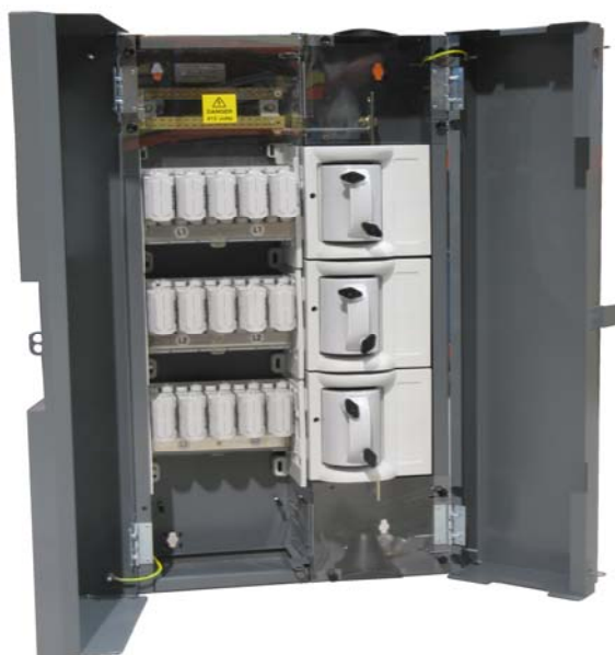
1 J version (RH supply)